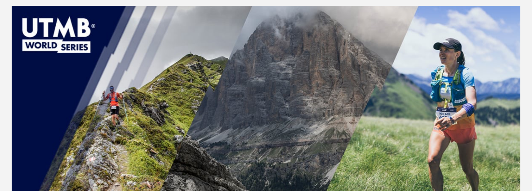
Press release - Chamonix (France), Tuesday 4 June 2024